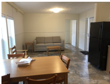
Trailer inside look